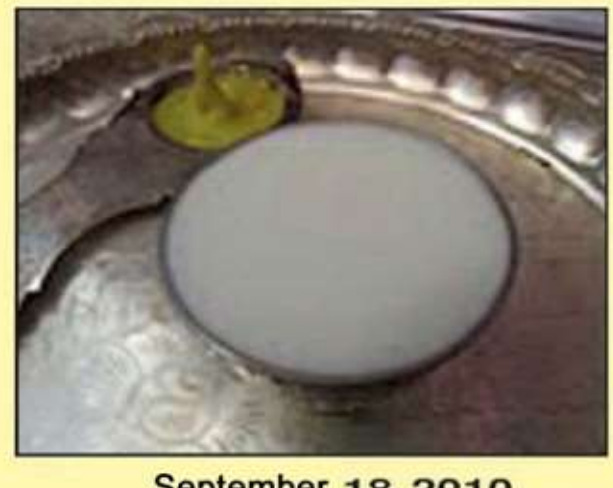
September 18, 2010