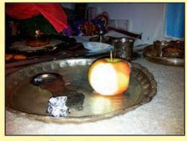
September 26, 2010