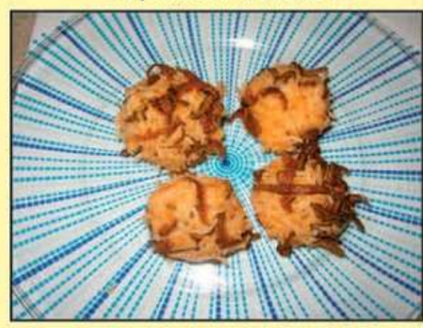
September 20, 2010