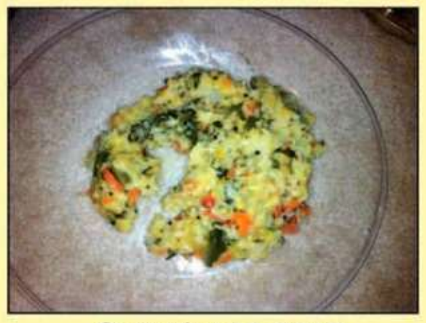
September 18, 2010