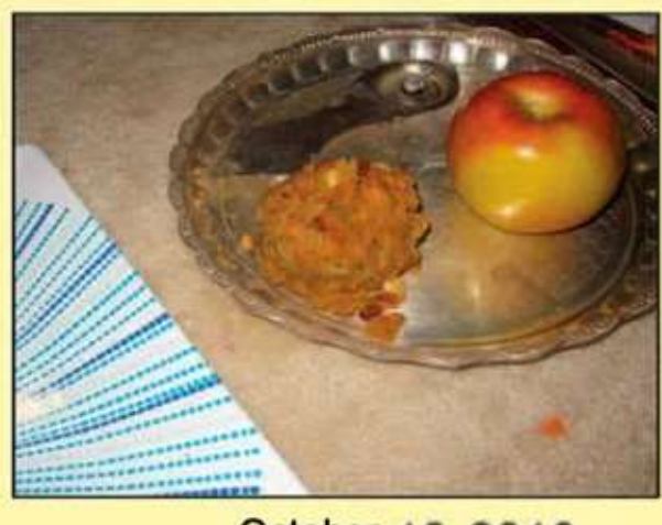
October 10, 2010