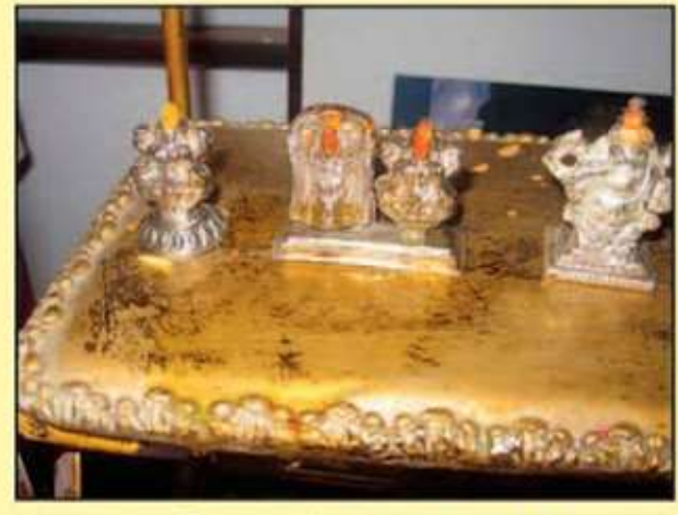
September 12, 2010