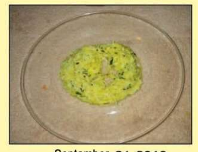
September 21, 2010