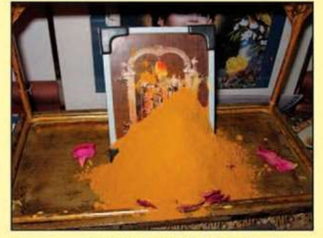
September 7, 2010