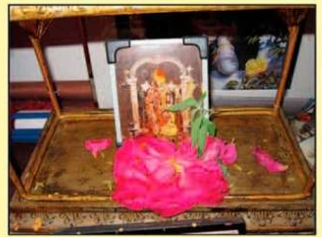
September 5, 2010