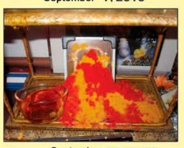
September 12, 2010